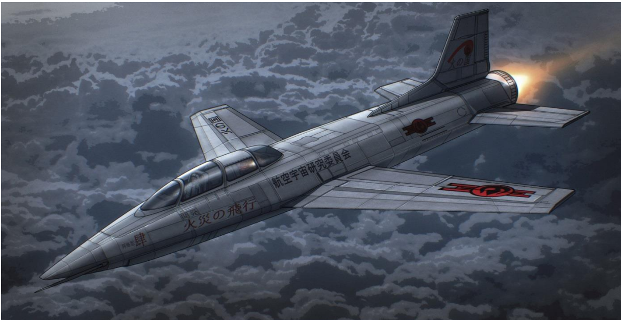
Mighty Wings – Shown here during Flight 4-43 in 187, the Agni IV was the most advanced test aircraft Project Fireflight produced. At the controls is Major Minhua of the Fire Air Force, with Capt. Tosa as Firebending Thrust Officer. This flight was briefly supersonic.

EDITOR'S NOTE: This is an excerpt from Professor Sato's book, Challenging the Cold Silence: The Inside Story of Project Phoenix Flight . It has never before been published in Galactic Standard.